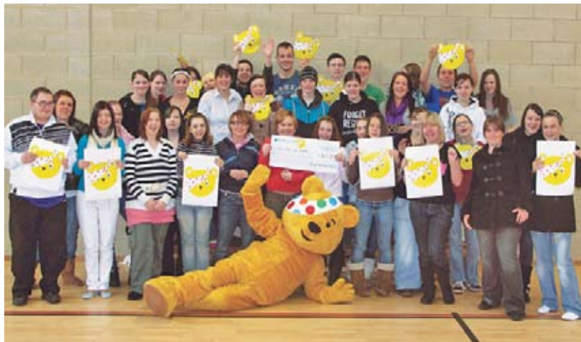
Pudsey with students who helped raise £965.39 for children in need.

Bishop Auckland College staff and students have raised nearly £1,000 for Children in Need. Students helped raise £965.39 for children in need, more than the College has previously raised for the charity, through a variety of a activities.