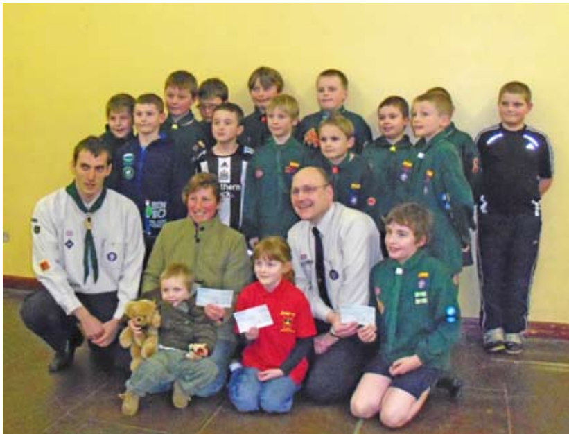
Representatives from the four community groups receiving their cheques from B.A.C.E.

Four community projects involving young people have received £200 each from the newly-formed Bishop Auckland Community Events group. The money was raised at a shopping and dining event, held at Wynyard Hall in Tees