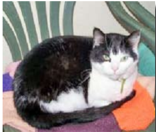
Jasper, the bigger of the two cats who likes affection.

"Caeser and Jasper have lived all their lives together. They are big, laid back cats and they do have their moments of madness and play together. Jasper is a big cat who likes affection and Caesar is the more quieter of the two, but also likes being made a fuss