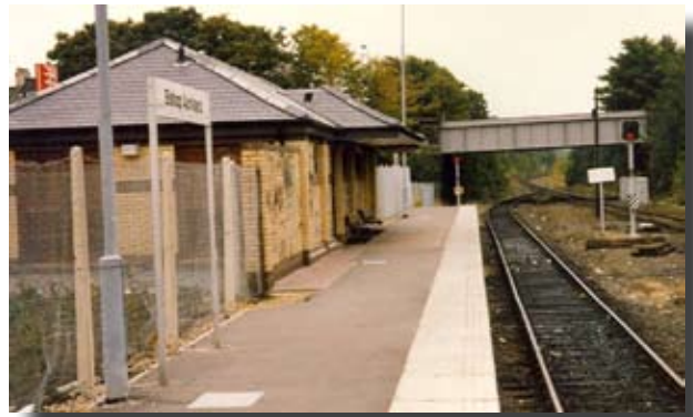
Bishop Auckland Train Station.

"The railway station is a great asset to the town, but it is undervalued at the moment.