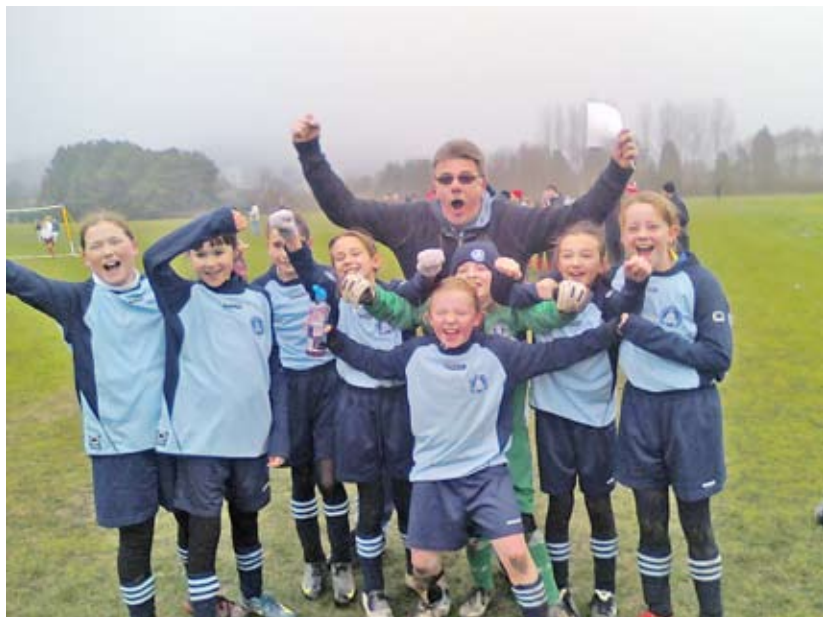
St Mary's Angels FC, who were recently crowned League champions.

Bishop Auckland St. Mary's Juniors F.C. is holding its second sportsman's night of the season on Friday, January 29th, with guest speaker