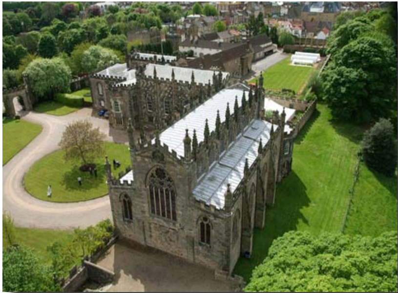
The Church is looking to sell the 12th century palace.

The future of Auckland Castle is in dispute, after some Church officials have said the bishop's palace should be sold.