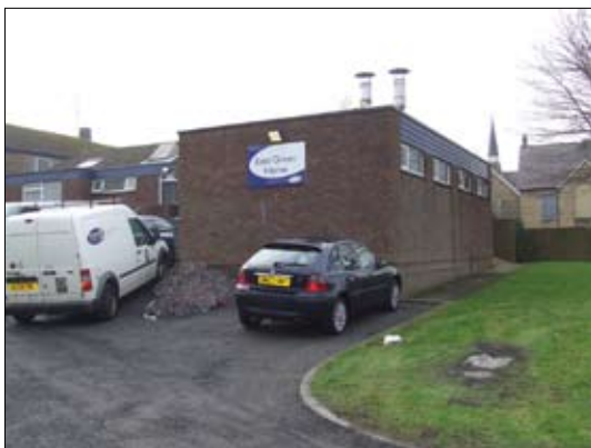
East Green Care home could close following consultation events.

Everyone affected by any changes to provision will be invited to give their views and all feedback will be taken into consideration before any decision is made, say cabinet members.