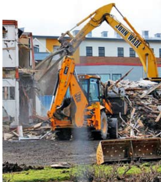
The final stage of demolition at the college.