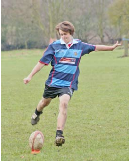
Bishop battled hard during the game against Westoe.