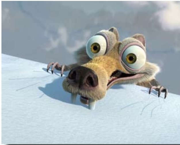
Scrat the sabre-toothed squirrel from the Ice Age movies.