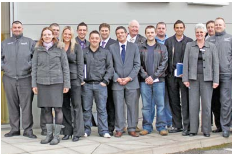
First cohort of learners on new Sales course.

A free sales course offered jointly by two organisations, Bishop Auckland College's Business Training Services (BTS) and SASDA, the enterprise agency in Newton Aycliffe, has proved a hit with new and existing businesses in County Durham.