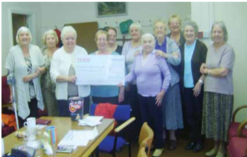
The ladies from Selby Social Club with their Tesco donation.

Selby Close Social Club in St. Helen Auckland is run for the senior citizens in the area. The club enables people to meet up, make friends and socialise. During the past few months, the club has been running various raffles and tombolas to raise money for