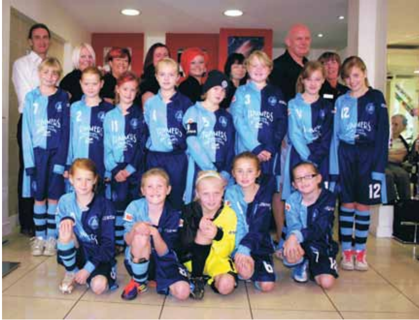
St Mary's Angels Under 12s in their new kit at Trimmers Hair Design.

St Mary's Angels Under 10s were delighted to receive new strips this week thanks to Trimmers Hair Design on Newgate Street, who have kindly sponsored the team. The girls from the club were also offered complimentary hair cuts at the salon.