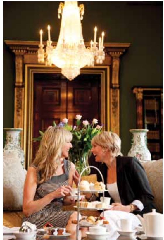
Enjoy afternoon tea in the palatial surroundings of Wynyard Hall.

Butterwick Hospice at Bishop Auckland are hosting a sumptuous ladies afternoon tea in the palatial surroundings of Wynyard Hall. The event will be staged on Wednesday 2nd November, from 1.30pm to 4.00pm. With only weeks to go to the festive season there are a range of crafts and stalls where you can get the most ornate and intricate gifts that include cards, jewellery, patchwork crafts, door hangers handbags, and Christmas decorations, to name but a few. Ladies will also have the chance to purchase tailored fashions for that special Christmas party or function after viewing a Festive Fantasia Fashion Show. Tickets are on sale now and it is advisable to book early, any special dietary requirements can be catered for. Tickets cost £18.50 per person (groups welcome), and credit or debit card payments are accepted. Call the Butterwick Hospice at