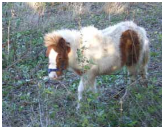
Little John was found tied to a tree with no food or water.

"The complainant went on to inform me that she had